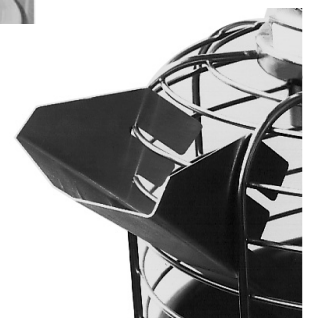
Hobart Ingredient Chute

Listed by Underwriters Laboratories Inc. and certified by NSF International.