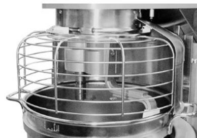
Hobart Bowl Scraper