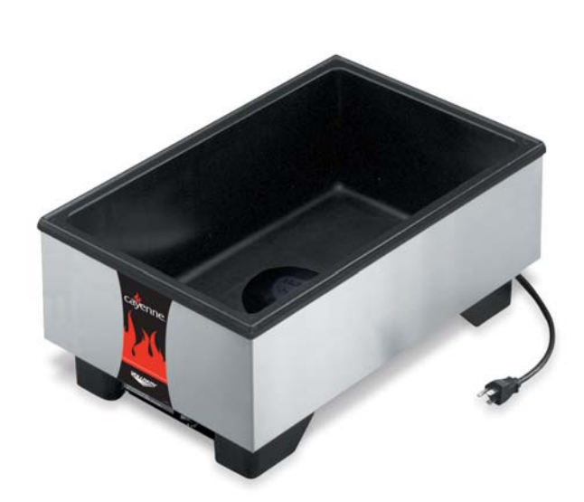
Cayenne® Model 1001 Wamer