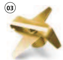
Emulsifying cutter blade Ref. 7910