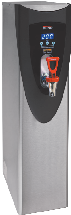
Model H5X Element

Dimensions: 28.5"H x 7.1"W x 17.6"D (72.4cm H x 18.03cm W x 44.7cm D)