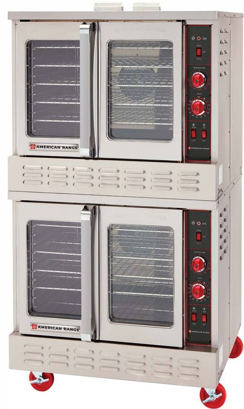
Model Shown MSD DBL (Standard depth)