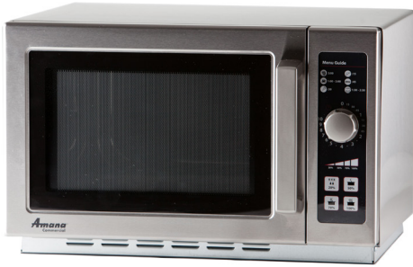
Model RCS10DSE shown